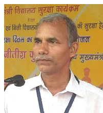
By: Er. Prabhat Kishore

Mother Language is the blood of the soul in which thoughts move and from which they grow. In our country, the "Mother Language" is often neglected and actively suppressed on the name of globalization. The present education system has completely ignored the mother language as the medium of instruction in schools, especially in English medium schools. The teachers at the