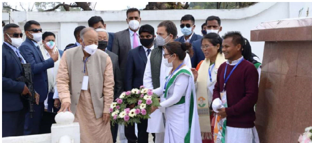
IT News Imphal, Feb 21:

Former Congress president Rahul Gandhi lambasted the PM Modi-led government, accusing the Bharatiya Janata Party (BJP) and RSS of 'undermining' the state's history, culture, and language when they come to the state.